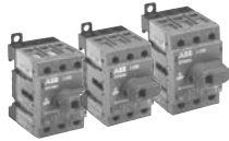
OT16F3 OT25F3 OT40F3